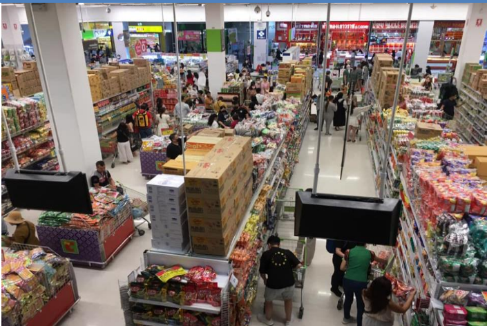
Figure 5: Inside Big C Supercenter's flagship store – tourists grabbed local snacks and dried goods to take home