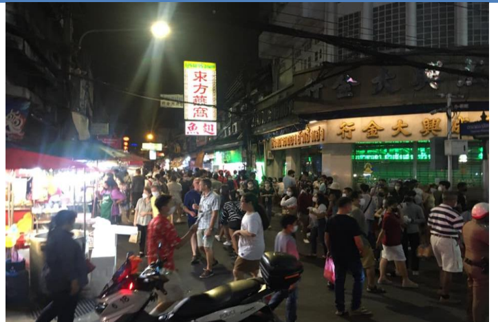
Figure 10: Yaowarat or Bangkok's Chinatown at night