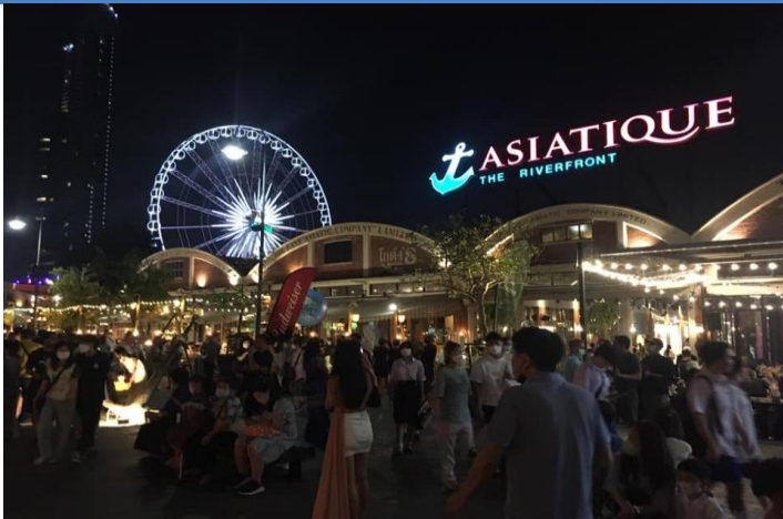
Figure 9: AWC's Asiatique The Riverfront open-air mall – visitor traffic has seen a rebound