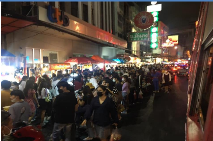
Figure 11: Thai locals and foreigners still keep coming for affordable street food at Yaowarat until late at night