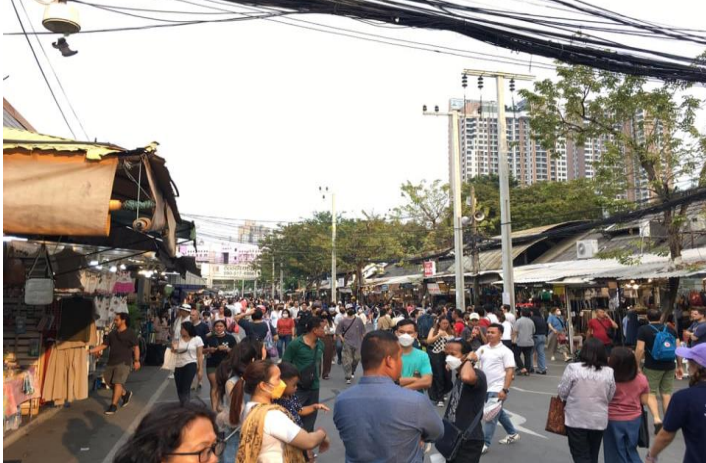
Figure 7: Chatuchak Weekend Market – we believe almost half of the traffic comprised international tourists