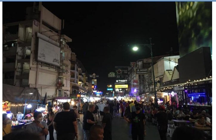
Figure 12: Westerners are returning to the backpackers' district of Khao San Road