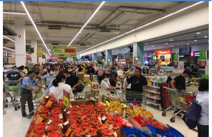
Figure 6: The Ratchadamri flagship store's check-out areas were crowded with foreign customers