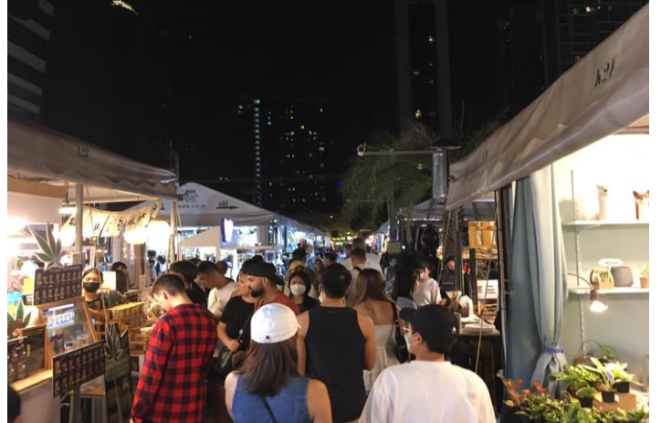
Figure 8: Jodd Fairs Night Bazaar at Central Rama IX mall has become Bangkok's most popular night market