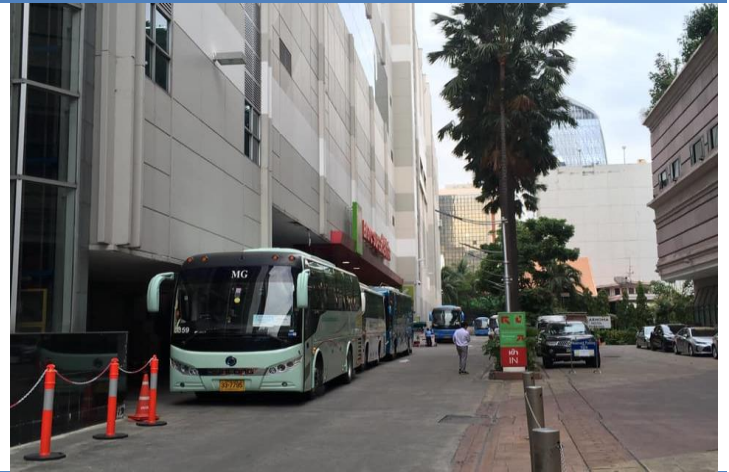
Figure 4: More tour buses at Big C Supercenter's flagship Ratchadamri store – mainly Vietnamese shoppers