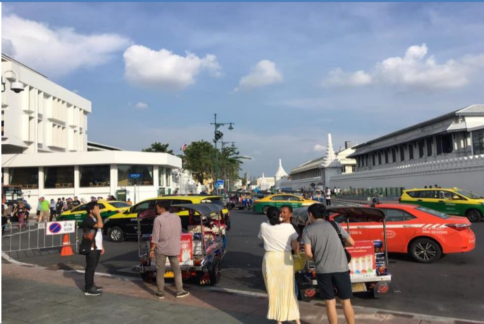
Figure 3: The Grand Palace – livelier with foreigners